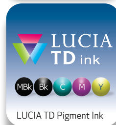
LUCIA TD Pigment Ink