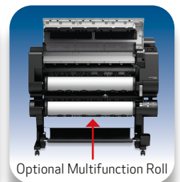
Optional Multifunction Roll