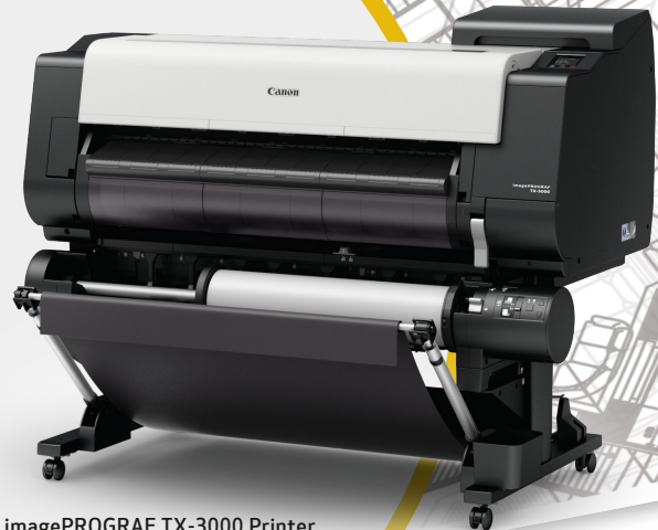
imagePROGRAF TX-3000 Printer Shown with Multipositional Catch Basket and Optional MFR