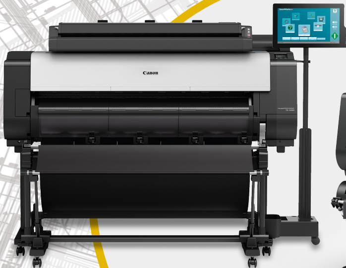
imagePROGRAF TX-4000 MFP T36 Printer Shown with TX Stacker